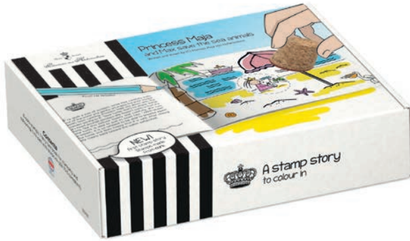
Attractive cardboard packaging with perforated EURO hole flap for hanging.